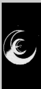
Sigil of Baphomet

The second, given below, relates to our sinister mythos, and is associated with Baphomet, whom we regard - in contrast to all other Occultists - as a female acausal and sinister being, who can manifest in the causal, and this sigil is known both as The Sigil of Baphomet, and as The Dreccian Moons of Baphomet.